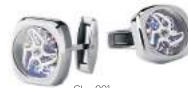
CL - 001

Le Rhône created the exquisite cufflink collection, an original collaboration with Freddy Tschumi TF Est. 1968. Five versions of cufflinks, revealing the hypnotic movement of the propeller, are presented in stainless steel, stainless steel with black DLC coating or pink gold plating.