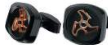
CL - 004