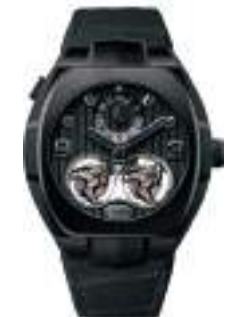
DOUBLE FLYING TOURBILLON HOME TIME