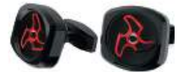
CL - 005