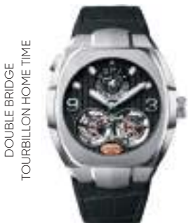
DOUBLE BRIDGE TOURBILLON HOME TIME