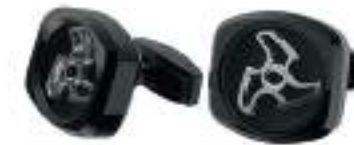
CL - 003