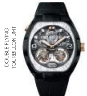
DOUBLE FLYING TOURBILLON JMT