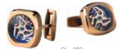
CL - 002