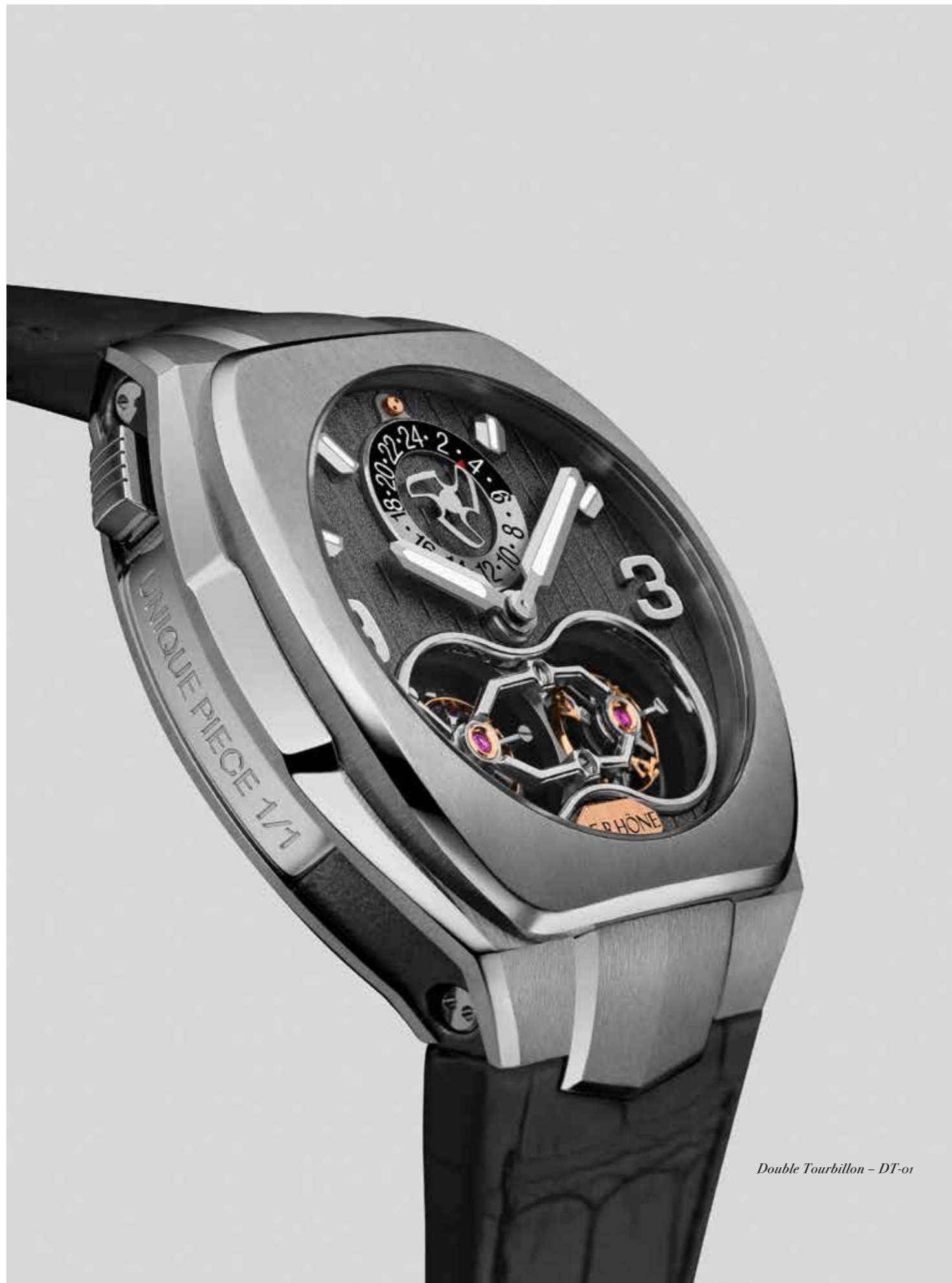
Double Tourbillon – DT-01