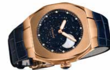
Grande Phase de Lune 41mm - Rose gold - Blue strap