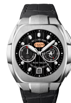
Röd Racér Steel - black dial

On a level with its masculine counterparts from the collection, the ladies' version of the Röd Racér features a snow-set crown and blue accents.