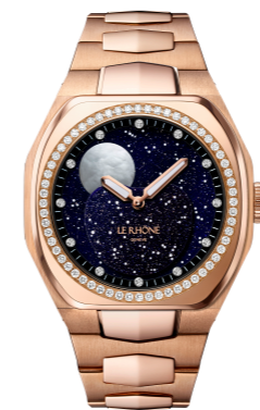
Hedonia Rose gold - Anthracite gray dial