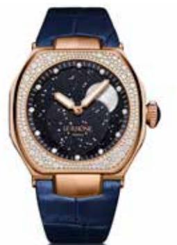
Grande Phase de Lune 37mm - Rose gold - Diamonds