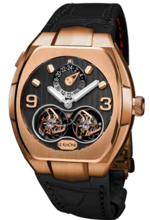
Double Tourbillon – DT-02

Each Le Rhône watch reveals a distinctively exclusive, exceptional character. Having your watch personalized by talented Swiss craftsmen makes it possible to create the timepiece that best corresponds with you. You become the designer of your own watch by choosing the various materials, finishes and colors.