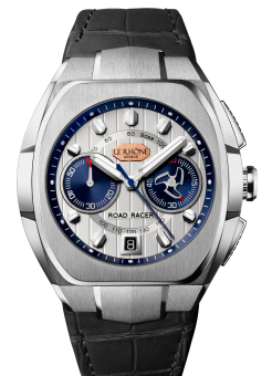
Röd Racér Steel - gray dial