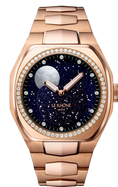
Moön Rose gold - Aventurine dial