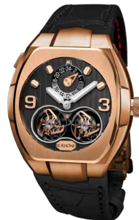
Double Tourbillon - DT-02

Each Le Rhône watch reveals a distinctively exclusive, exceptional character. Having your watch personalized by talented Swiss craftsmen makes it possible to create the timepiece that best corresponds with you. You become the designer of your own watch by choosing the various materials, finishes and colors.