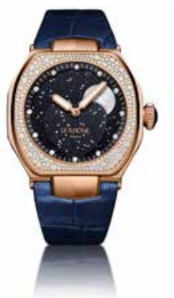
Grande Phase de Lune 37mm - Rose gold - Diamonds