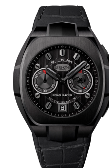
Röd Racér Steel with black DLC - black dial