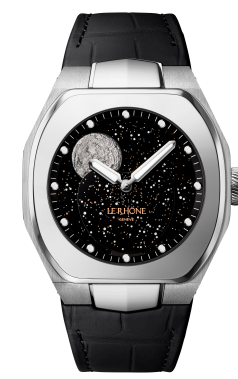
Moön Black Cosmic 41mm - Steel case - black strap